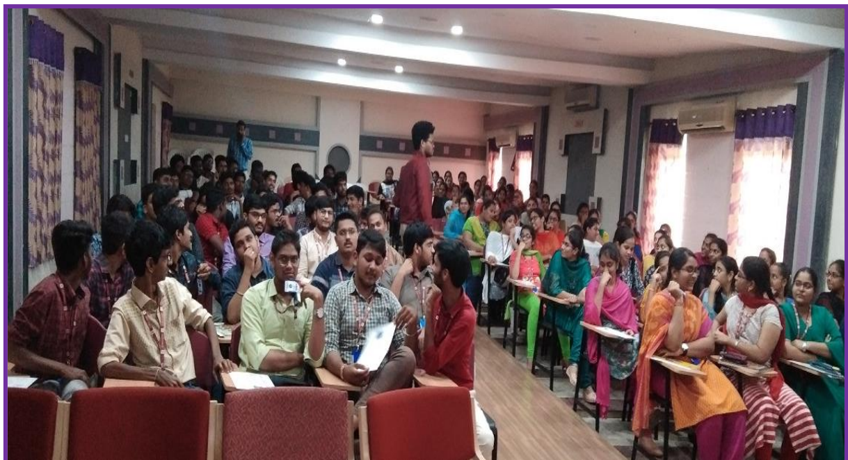
Fig: II B.Tech Students participating in an event.